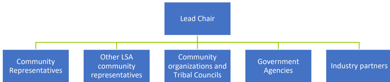
Figure 5-1: Webequie Supply Road Community Readiness Working Group Structure

The Community Liaison Officer(s) (CLO), or equivalent in the Proponent's governance structure, will be recruited under the CRWG to facilitate regular engagement between the proponent, contractors, and participating community, and to coordinate the implementation of the CRP. The creation of roles for Webequie community members as liaison officers can serve various functions, such as disseminating up-to-date information about Project activities and opportunities (e.g., employment, timelines, potential disruptions) to the community. They would also act as the initial point of contact for any sensitive issues or concerns that arise between the Project and Webequie community members employed by the Project, or between the Project workforce and the broader community. These community liaison officers would be trained to help deescalate conflicts between Webequie First Nation and non-local Project employees before further interventions are necessary.